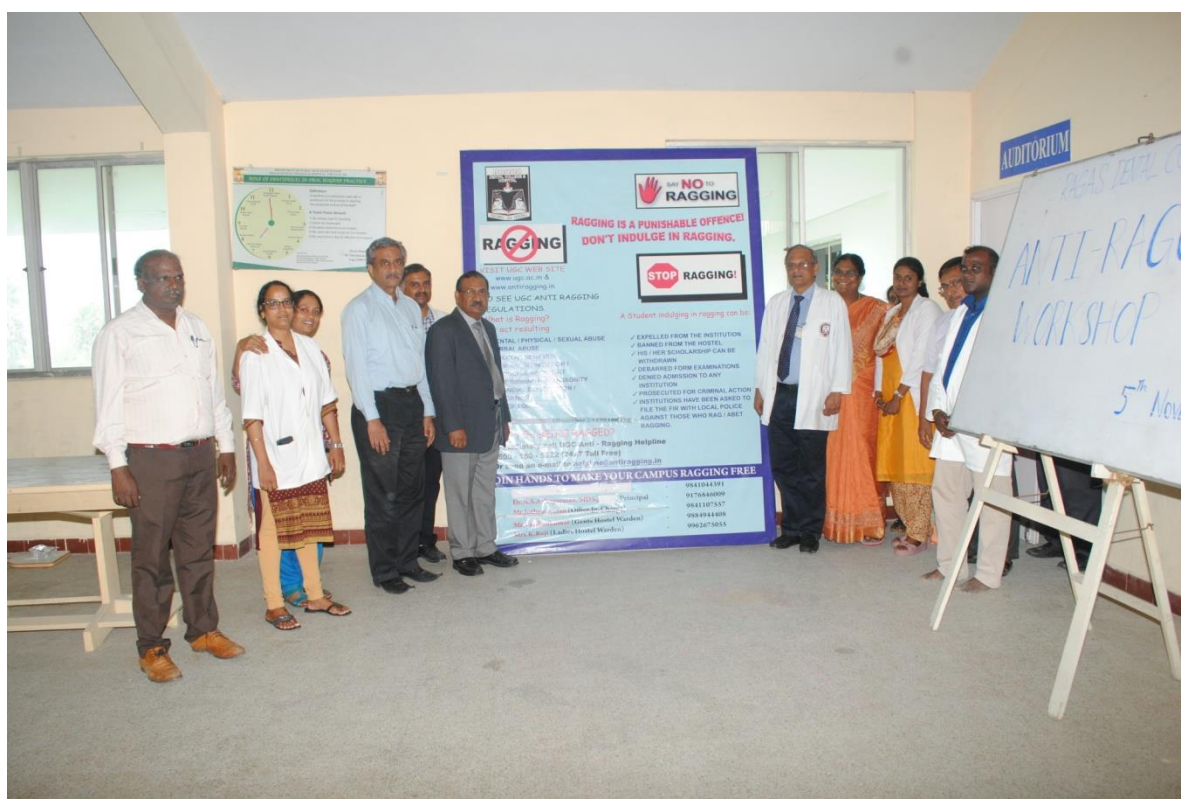
Faculties and Guests with the Anti – ragging poster.