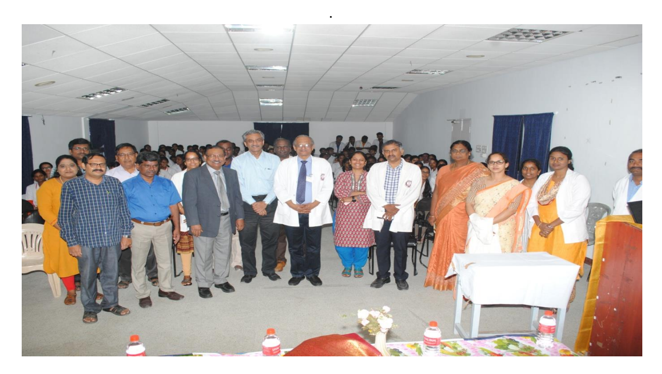
Guests, Faculties, Hostel wardens, Students and Parents