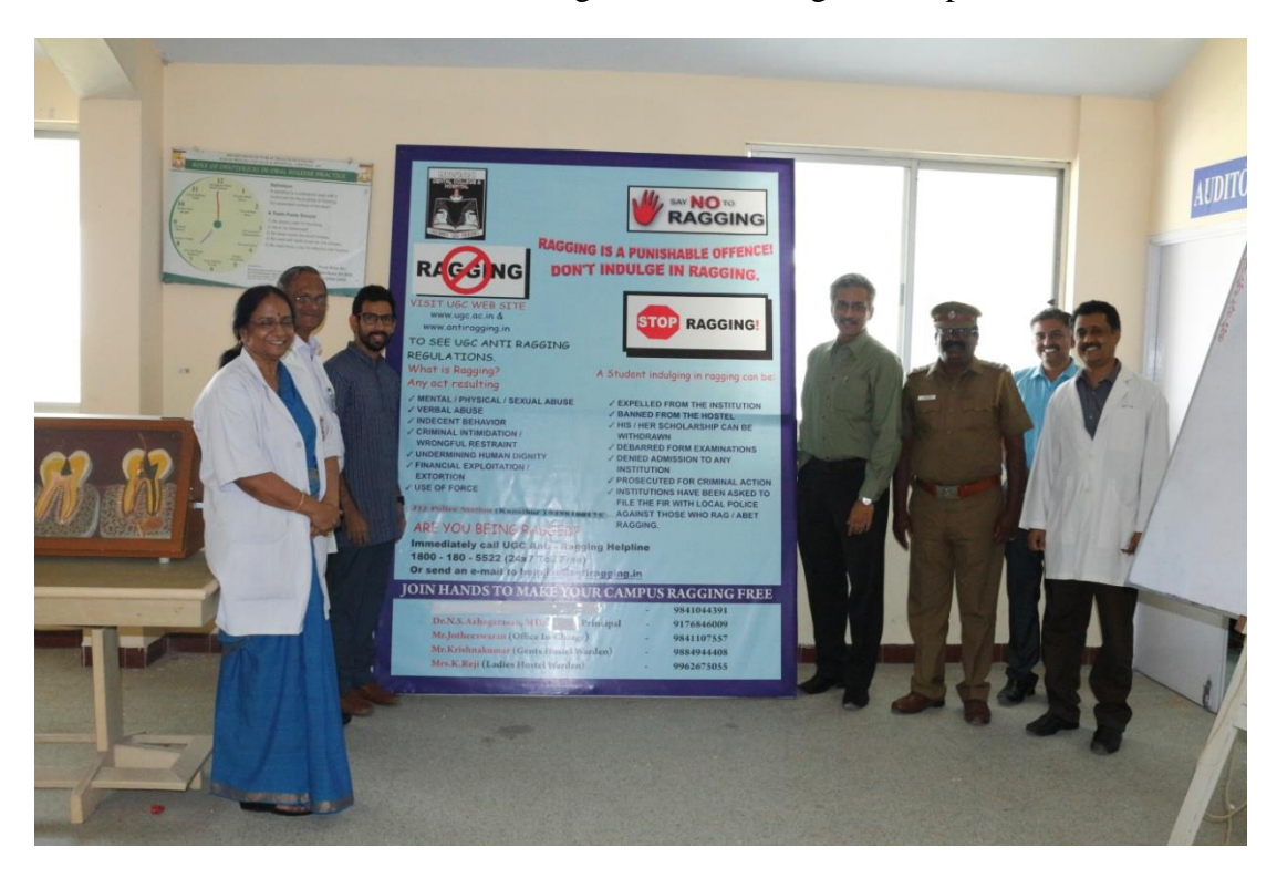
The faculties of Ragas Dental College & Hospital along with the invited guest speakers